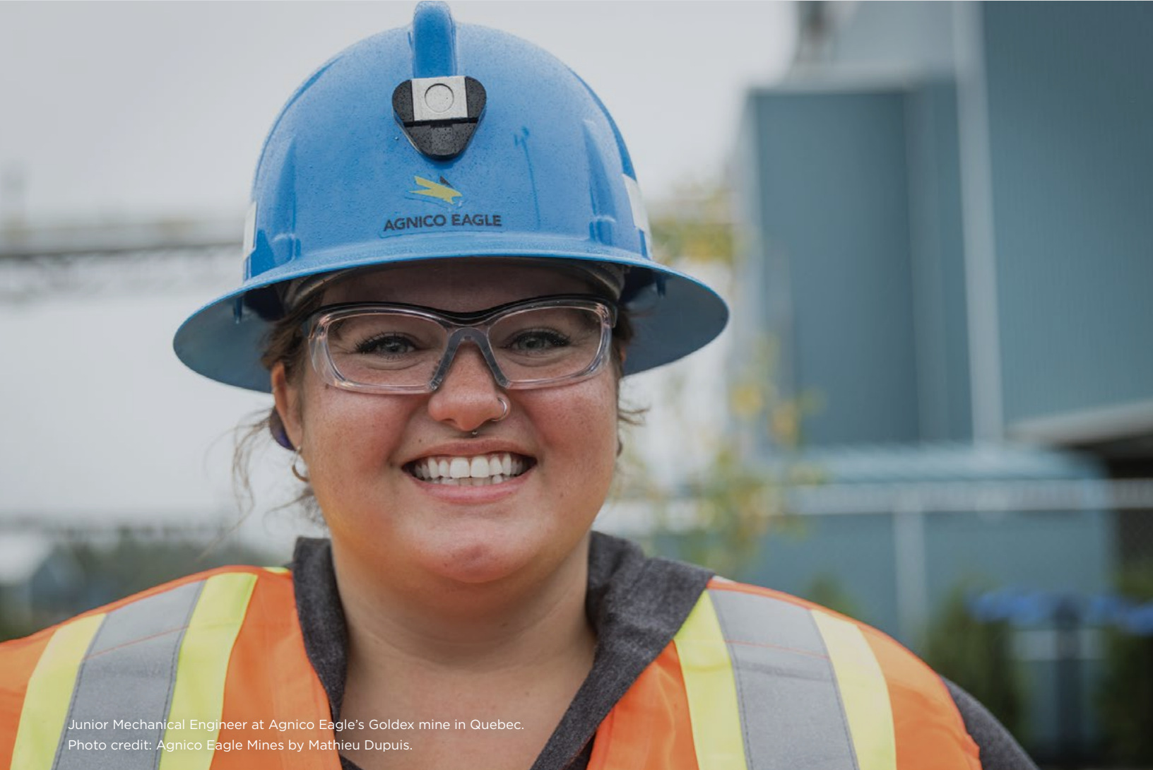
Junior Mechanical Engineer at Agnico Eagle's Goldex mine in Quebec.