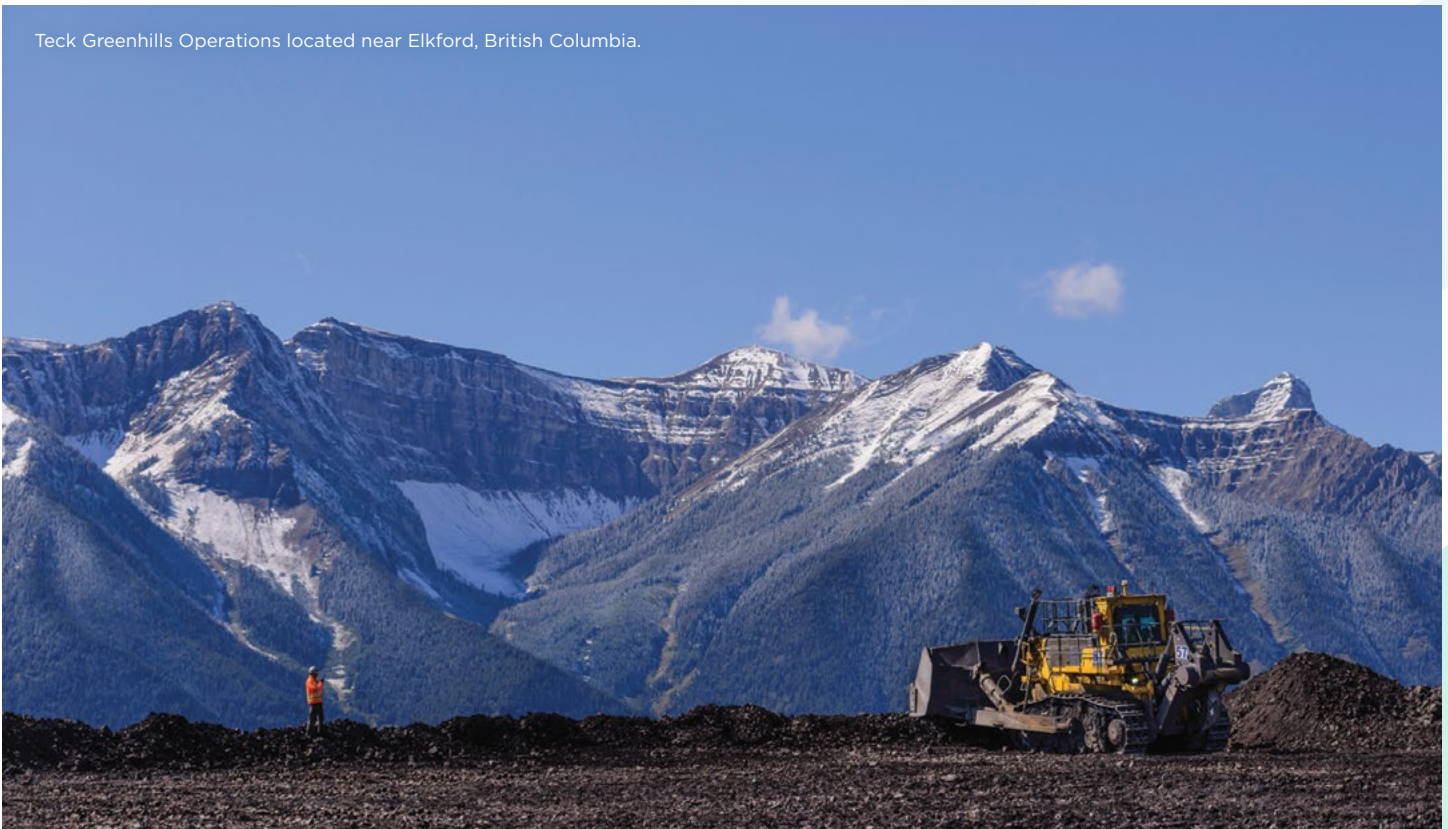
Teck Greenhills Operations located near Elkford, British Columbia.

Another role played by the COI Panel is in relation to the post-verification review process, a key component of the TSM assurance framework, as described on a previous page.